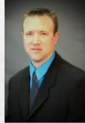
Brac Mettler Dragline Planner