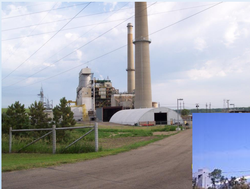
R.M. Heskett Station